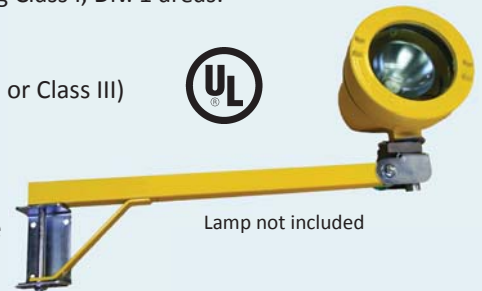
Lamp not included

TOLL FREE: 1-800-854-0021 FAX: 715-839-8145 Web: www.ldpi-inc.com E-mail: sales@ldpi-inc.com