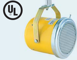
Lamp & glare guard included