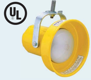
Lamp not included